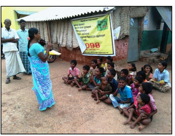
It is a 24 x 7 hrs dial up – Toll Free Telephone Number 1098 connectivity for receiving calls from any area of the district and our organisation will send the field staffs to extend the support services to the affected victim children in the district.